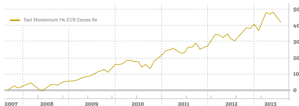
Simulated performance of the Index over 6 year period ending 31 July 2013

Source: Bloomberg (31 July 2007 to 31 July 2013. Data from 31 July 2007 to 27 February 2011 is simulated. Data from 28 February 2011 to 31 July 2013 is live) after all fees and charges but before taxation.